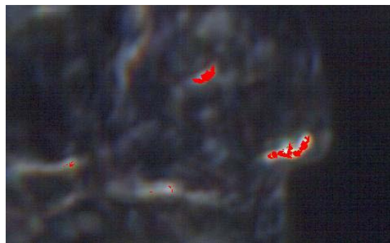
Figure 3. Plant Tissue with Mapping of Clostridium

One important advantage illustrated from this approach is the ability to detect intracellular spectral differences and thus chemical information at a sub-cellular spatial scales (e.g., sub-micrometers), as shown in the single cell image ( Figure 1 ).