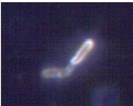
Figure 1. Clostridium

Some of the images captured by LBNL show the ability of the CytoViva system below. Figure 1 illustrates a hyperspectral scan of the clostridium bacteria at 100X. From this image, we select different pixels to build a spectral library ( Figure 2 ) which is used to confirm the presence of the clostridium in other environments. Figure 3 is a hyperspectral scan at 100X of plant tissue where the clostridium bacterium has been exposed. Pixels in red map the presence of clostridium spectra, illustrating the bacteria's presence and location in the tissue.