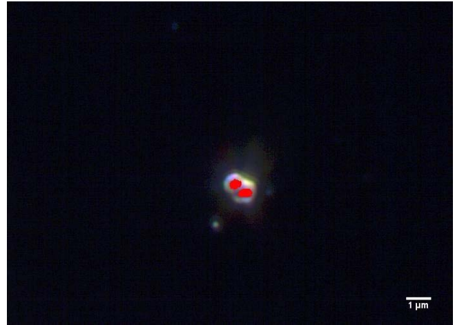
Figure 2. unstained spores of Bacillus anthracis

The spectra from the two different species is illustrated in the spectral library in Figure 3. These different spectra are easily distinguished by variances in their peak location and shape.